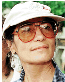
Ida Luz Rodriguez Fighter in Puerto Rican Independence Movement. Incarcerated for 19 years. Granted clemency in 1999. Continues to resist U.S. occupation.