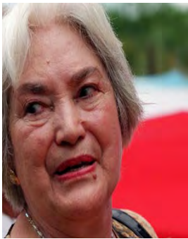
Lolita Lebron Advocate and warrior for Puerto Rican independence. Incarcerated for 25 years. Continued activism upon release. Transitioned in August 2010.