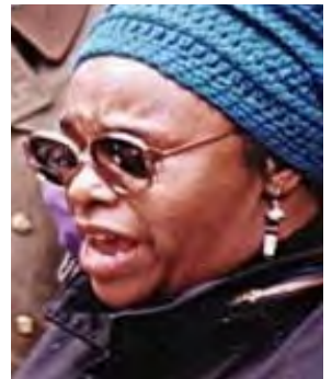
Safiya Bukhari Black Panther Party and Black Liberation Army fighter and activist. Incarcerated for 9 years. Continued activism upon release. Transitioned in 2003.