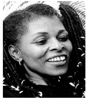
Assata Shakur New Afrikan freedom fighter and warrior. Incarcerated for 6.5 years before she was liberated in 1979 and now lives in exile in Cuba.