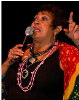
Dylcia Pagán Fighter in Puerto Rican Independence Movement. Served 19 years in prison. Granted clemency in 1999. Continues to resist U.S. occupation.